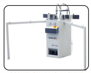
CORNER CRIMPING MACHINE